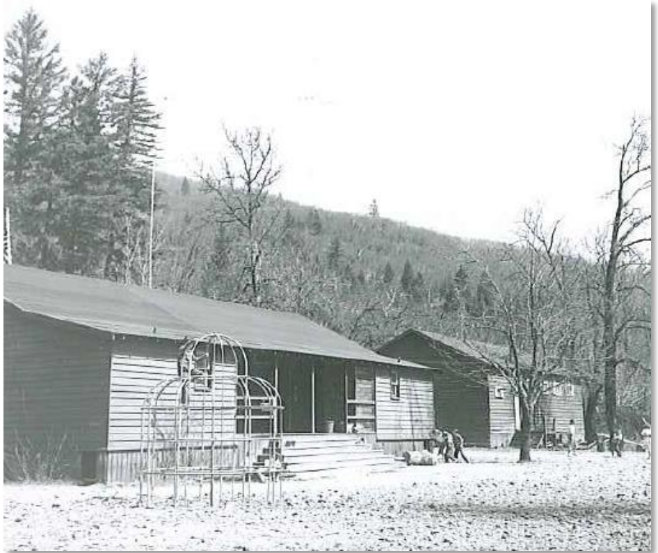
Van Duzen School c.1962

A second school was at Buck Mountain and another school was built “near Cobbs” in Humboldt County, but that school was destroyed by flooding. 3 Interestingly, none of these schools or school locations are listed in the historic school records located at the Trinity County Office of Education. However, the school district of Mad River, to which Van Duzen eventually belonged, was listed first in the records of school visits in 1898. Like many other schools in Trinity County, it’s very possible that